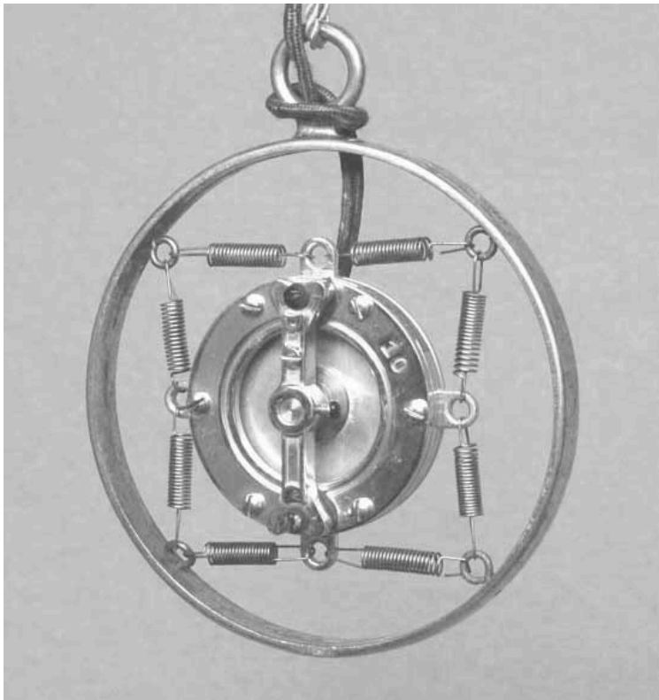
A Continental Microphone 18

Blind Willie Johnson's entire recording career was between 1927 and 1930. During this time he recorded 30 tracks for the Columbia Recording company on their 14000D "race records" series. 17 During this time record companies were replacing older recording techniques with the electrical recording process that used an electric microphone to capture the musicians voice and playing. With this being the new technology, Blind Willie Johnson had the privilege of being one of the pioneering musicians to record his music in this new way.