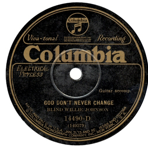
Three of Blind Willie Johnson's Record Labels 6