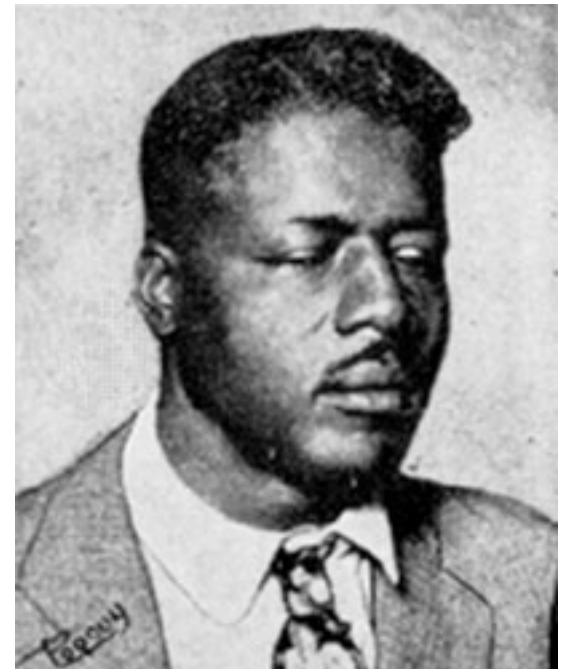
Blind Willie Johnson

All but one of Blind Willie Johnson's songs were related to his religion. He sang about biblical stories and how, "Everybody Ought To Treat A Stranger Right." His message was clear, Blind Willie Johnson was telling his listeners to "Get right with God" before it's too late. 7 His music even took on a preacher-congregation relationship. Johnson would sing a couple verses, like a preacher speaking, then finish the verses with his guitar, like a congregation responding to their preacher.