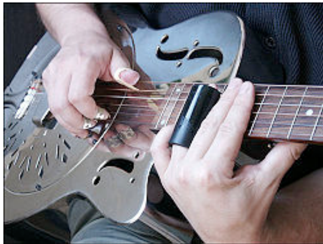
A Slide Guitarist With Metal or Glass On Their Finger 10