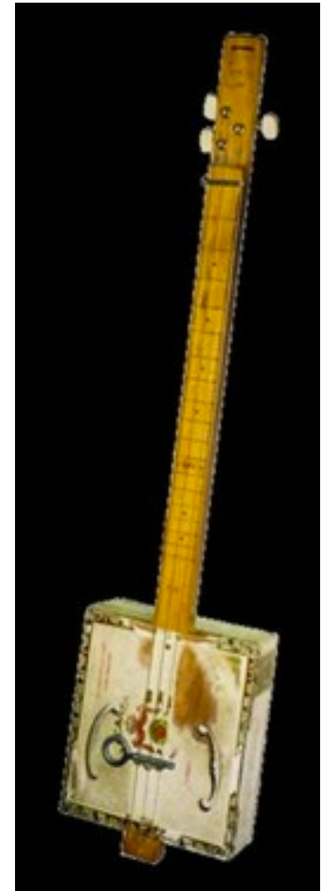
New Aged Cigar Box Guitar 5

There is no historical mention of Blind Willie being trained in the slide guitar or in his unique singing style. However, we do know that Blind Willie Johnson grew up in a church congregation. An Arizona periodical reported that at a very young age, Blind Willie Johnson told his father that he wanted to be a preacher, “and then made himself a cigar box guitar.” 4 His early interest in playing the guitar and wanting to be a preacher explains his style of singing where he sings as though he is giving a sermon to a congregation.