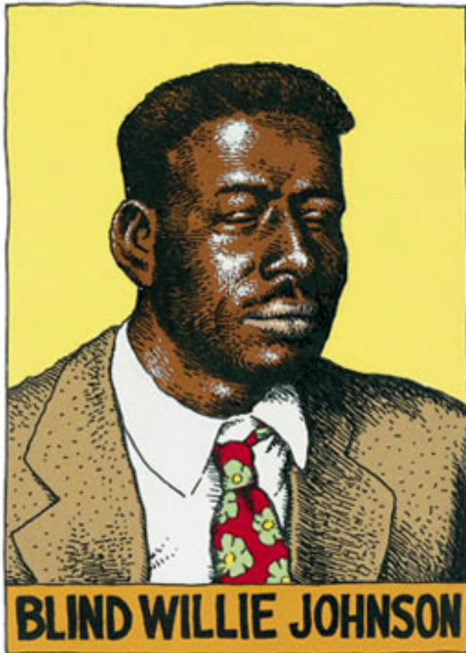
R. Crumb's Drawing of Johnson 3

Blind Willie Johnson's mother died when he was very young. The pain of growing up without his mother must have led him to writing and singing "Nobody treats you like mother will when mother's dead" in his song "Mother's Children Have a Hard Time." As if to reaffirm his feeling, his step-mother threw lye in his eyes to get revenge at his father, or so the story goes. There are several stories of how Willie Johnson became blind, but regardless of the different stories, growing up without his mother contributed to who he became.