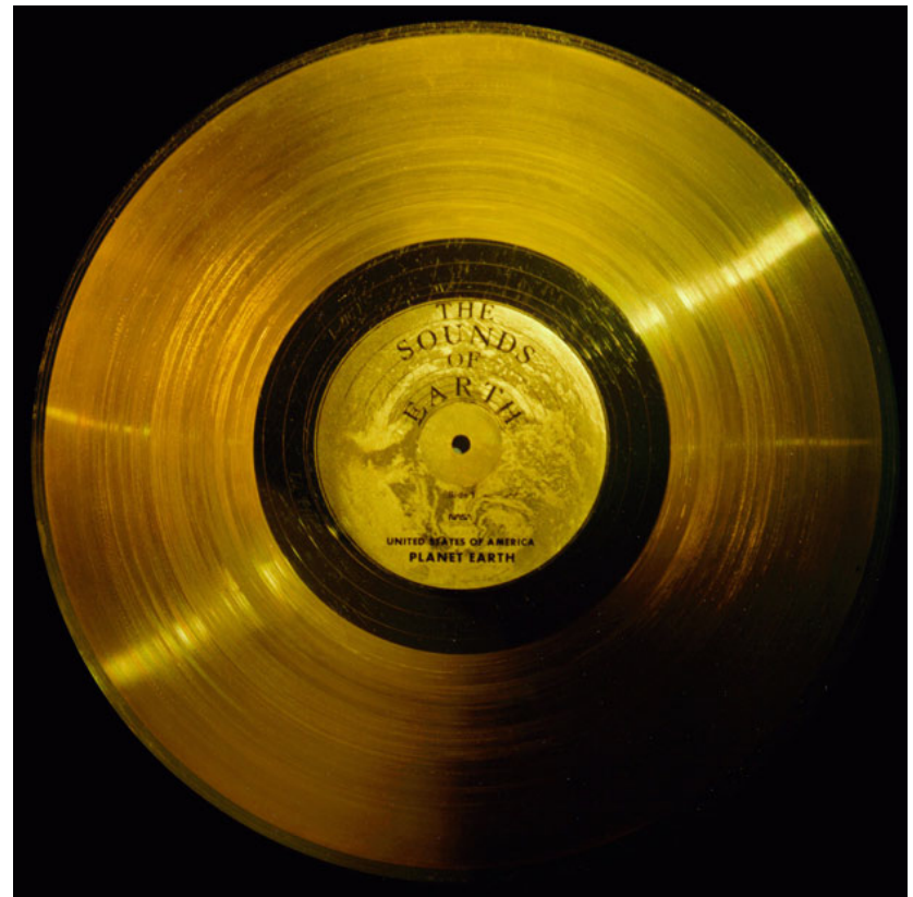
The Sounds of Earth was placed on the Voyager 1 22